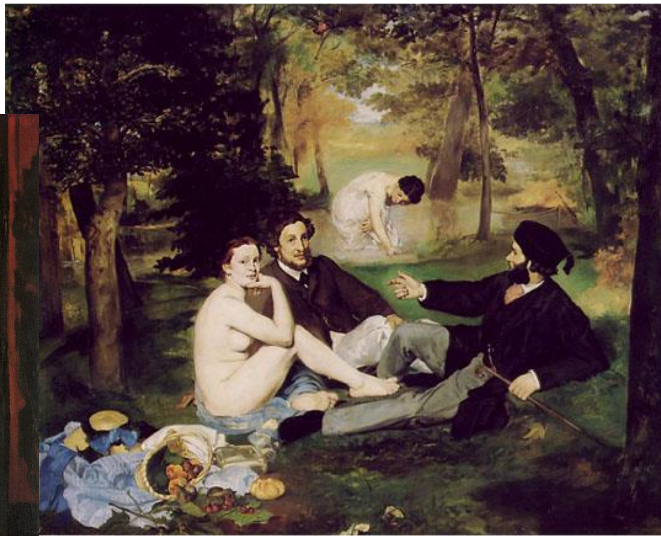
Luncheon on the Grass